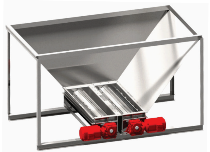
Double Perforator with Chute